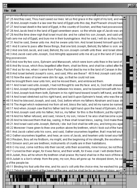
Figure 2: The ScrollSearcher with multiple result bars.

The SeeSoft system uses a categorical slider to enable searches of multiple files represented as thin rows (Eick et al. , 1992). Eick (1994) uses a generalization of sliders to present distributions and allow selection of disconnected intervals. However, these systems do not tightly couple the navigation of scrollbars to the presentation of search results.