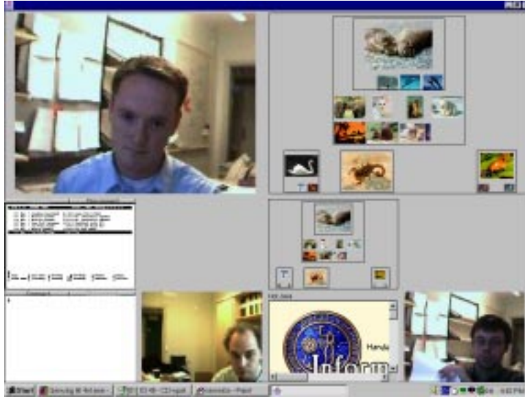
Figure 4. The Focus + Context Desktop, incorporating several different applications

browser and the Digital Variants browser, this can in fact be a very useful technique for combining different types of views or building a hierarchical visualization.