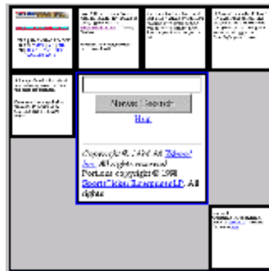
Figure 3. The WEST Browser allows for several different views of the same web-page source

We can now see that according to our formal description, any IV that fulfils the constraints posed by IV' can be incorporated into the set [IV]. This means that we can incorporate any information visualization IV into any higher-order visualization IV' . This opens a lot of interesting possibilities: there is for instance nothing to stop us from applying several focus+context visualizations IV , IV' , IV'' , etc. to each other. As we saw with the hierarchical image