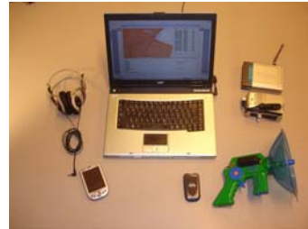
Fig. 2: Hardware