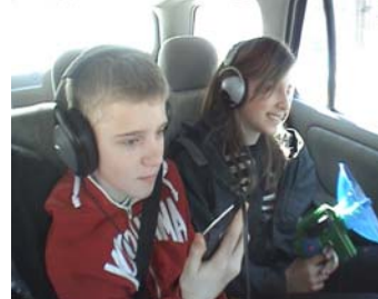
Fig. 4. Server path prediction and journey events. Fig. 5: Children testing prototype