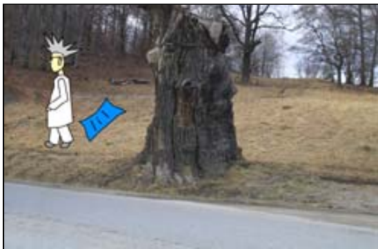
Figure 1: Screenshot from local story.

Fighting ghosts requires energy. Therefore, it is essential that the player have some success, not only at avoiding being killed, but also at sucking energy from the attacking creatures and maintain the energy level. Feedback on the energy level is presented in an energy indicator on the virtual window (fig. 2).