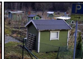
Figure 6: An allotment.

Second, the objects chosen were located close to the road, at about ten to fifty meters distance. The proximity adds to the sense of motion, which is central to the highway experience (Appleyard et al, 1964). However, the time for identification and manipulation is decreased making game manipulation harder. Further, most of the real objects chosen were placed on one side of the road, rather than on both sides. The allotment was an exception, where the player travels through the object and gets surrounded by virtual objects. According to Lynch, the latter type of object creates a specific sense of drama, which affects the road experience. Again, the