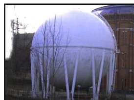
Figure 3: A gasometer.

an allotment or a gas works. Areas are easier to distinguish than smaller items. But the choice of objects must also be considered in terms of adequacy for manipulation. The player has to know where to look when aiming. A virtual object can be more difficult to find if the player is uncertain where to look within the physical object. The player has to find exactly the right spot in the area to look to find the virtual object. We believed that it would not add to the gaming experience to search the whole area just for one virtual object. We have therefore chosen to add multiple virtual objects on large physical objects. This is hereafter referred to as a patch event since the virtual objects can be seen as a number of patches on a large roadside body. Examples include an allotment area inhabited by several virtual creatures or a gas works area containing virtual tools. Wrap events consist of a singular virtual object tied to a specific physical object, e.g. a virtual document dropped at an old oak tree, or a ghost inhabiting a cottage. They provide for different manipulative challenges when finding the virtual objects at a specific area and aiming at them.