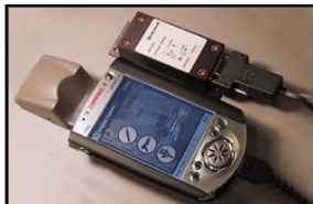
Figure 7: Hardware

A prototype has been built to gather initial user feedback. The game is implemented on a Pocket PC equipped with a GPS receiver and a digital compass module (fig. 7). The compass provides heading, as well as roll and pitch output. Data needed to run the game is locally stored in a database. This makes it very easy to provide content into the game.