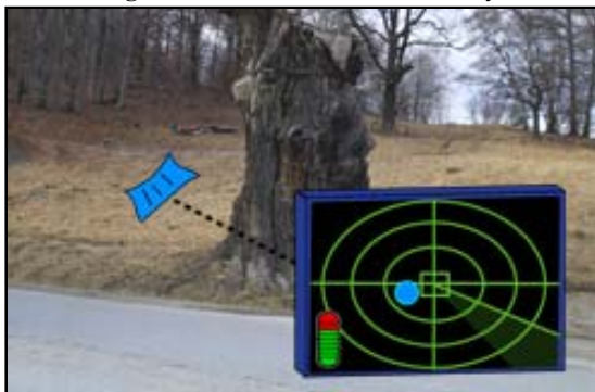
Figure 2: Description of manipulative event.