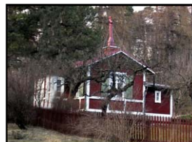
Figure 5: A little cottage.