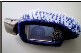
Figure 8: Gaming device