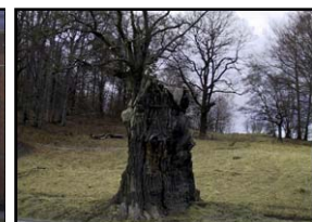
Figure 4: An oak tree.